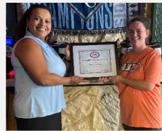
Spanky's Bar & Grill