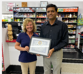
Midway Little General