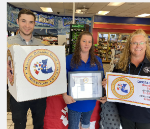
Break Time 3151