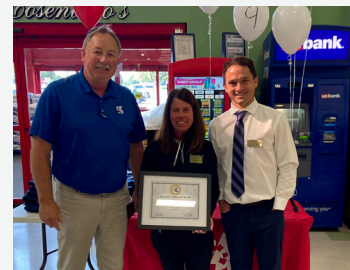
Price Chopper 285