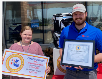
Alta Convenience 6574