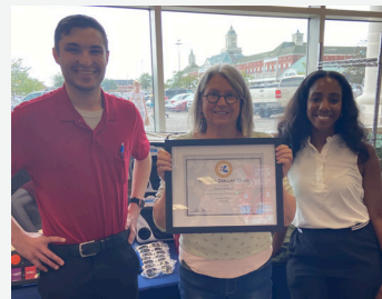
Schucks Market 258

We'd also like to shout out to the following retailer for selling more than $250,000 in Club Keno last year, earning their place in the 2022 Keno Crown Club (KCC). This retailer holds the distinction of making both the MDC and KCC groups for their high sales last year. Well done!