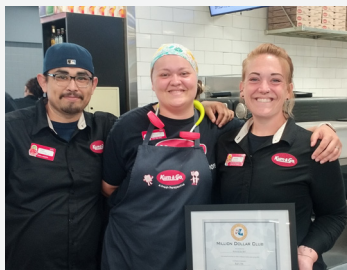
Kum & Go 561