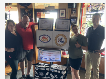
Dylan's Sports Bar & Grill