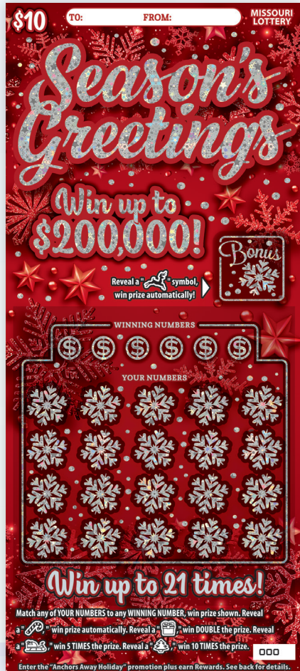
$10 Season's Greetings $200,000 top prize