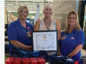
Price Chopper 900