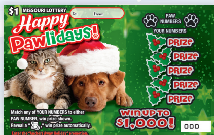
$1 Happy Pawldays $1,000 top prize