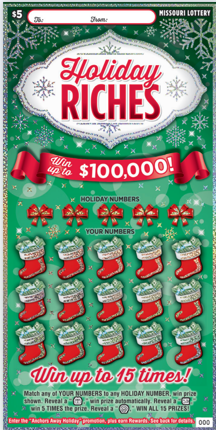
$5 Holiday Riches $100,000 top prize