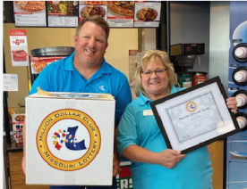
Break Time 3072