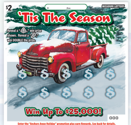
$2 'Tis The Season $25,000 top prize