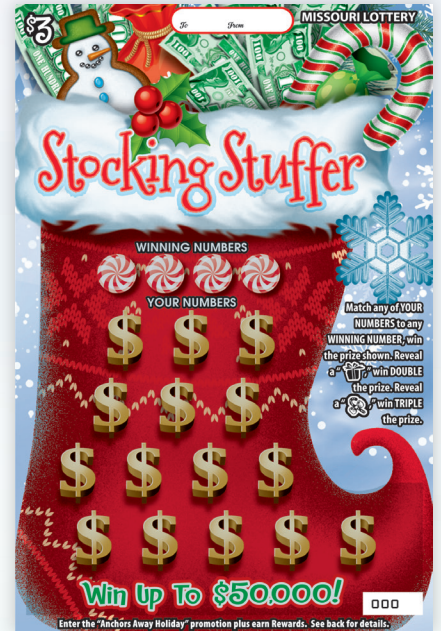
$3 Stocking Stuffer $50,000 top prize