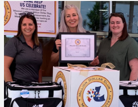
Kum & Go 578