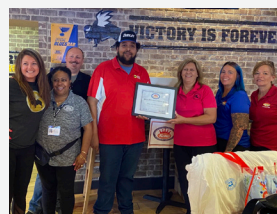
Buffalo Wild Wings Grill & Bar