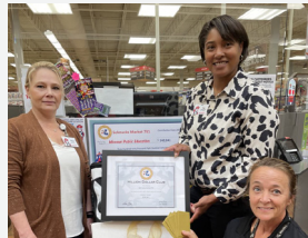
Schnucks Market 731