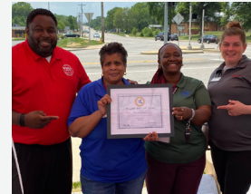
Alta Convenience 6511