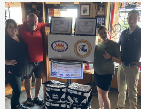
Dylan's Sports Bar & Grill

Similarly, we're also celebrating retailers who sold more than $250,000 in Club Keno last year. The following earned entry into the 2022 Keno Crown Club for their high sales.