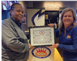
Buffalo Wild Wings