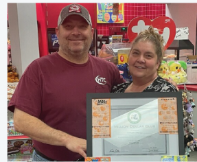
Harmon Tire Co.