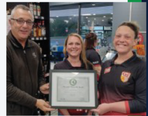
Kum & Go 561