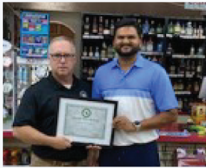
Discount Smoke & Liquor