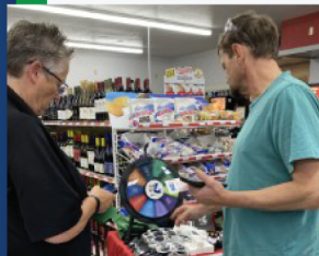
Midway Little General