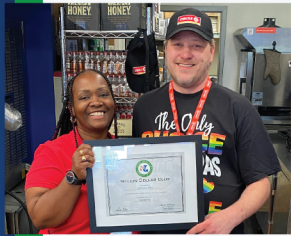
Circle K 1641